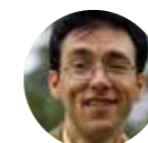
- DR. TADDY BLECHER

“The new gold is our youth. This is a new kind of mining; mining infinity”