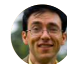
- DR. TADDY BLECHER

“The new gold is our youth. This is a new kind of mining; mining infinity”